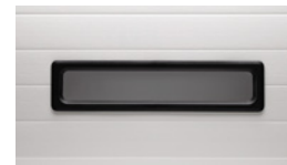
24" X 6" DOUBLE INSULATED ACRYLIC WINDOWS WITH BLACK FRAME