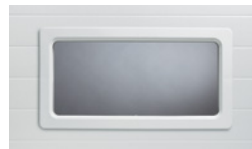
24" X 12" INSULATED GLASS Available with either a black or white frame.